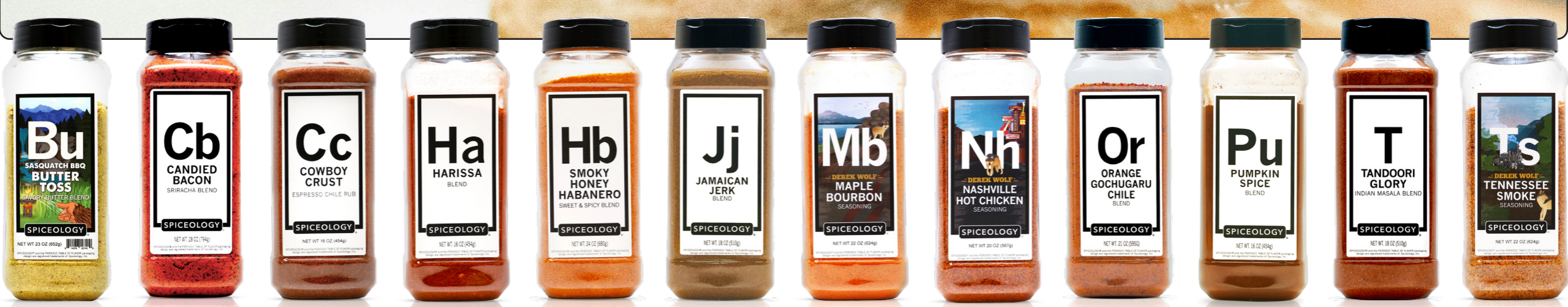
MIN 10705 MIN 11325 MIN 10152 MIN 10175 MIN 10184 MIN 10191 MIN 10200 MIN 10211 MIN 11465 MIN 10241 MIN 10268 MIN 10270

Below are our Top 12 favorite blends you can mix into maple syrup to add depth of flavor to whatever brunch dish you're dousing: