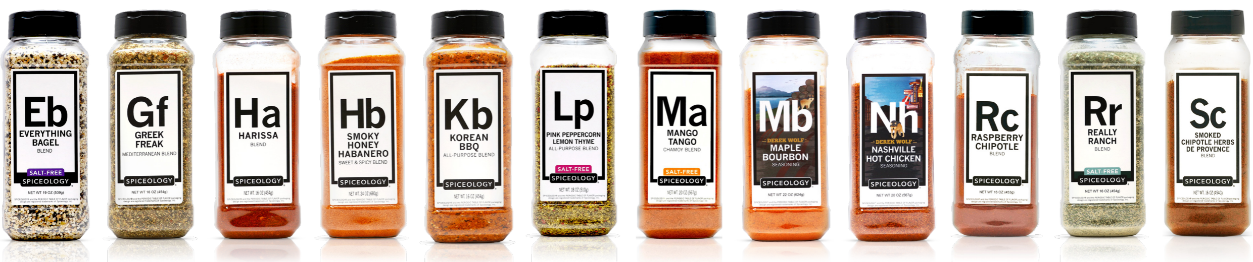
MIN 10599 MIN 10203 MIN 10175 MIN 10184 MIN 10193 MIN 10603 MIN 10602 MIN 10200 MIN 10211 MIN 10243 MIN 10606 MIN 11464