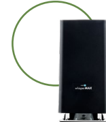
ScentAir Whisper MAX