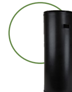
ScentAir Direct Tower