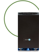
ScentAir Whisper PRO